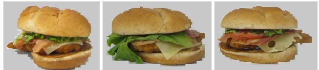
Fig. 1. Three different instances of the same food in the PFID dataset [3].

Automatic food classification is an emerging research topic, not only to recognize food images for the web and social networks application domain (e.g., for advertising purposes). Indeed, researchers (in different fields) study food because of its importance under medical, social and anthropological point of view. Food images can provide a wider comprehension of the relationship between people and their meals. Hence, automatic food classification can be useful to build diet monitoring systems to combat obesity, by providing to the experts (e.g., nutritionists) objective measures to assess the food intake of patients [1, 2]. On the other hand, food classification is a difficult task for vision systems, and offer an exciting challenge for computer vision researchers. Food is intrinsically deformable and presents high variability