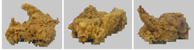
Fig. 3. Three different classes of the PFID dataset [3]. Left: Crispy Chicken Breasts. Middle: Crispy Chicken Thighs. Right: Crispy Whole Chicken Wing

instances of each class for training, and the 6 remaining images of the third instance of each class for testing. We employed the libSVM library [15] to assess the class-based Bag of Textons representation described in the previous section.